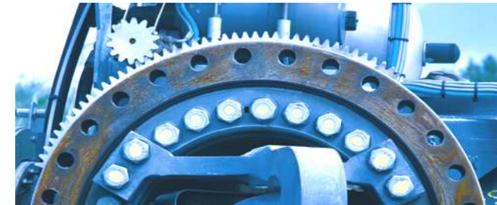
Wind turbine machinery